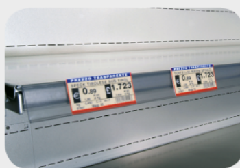
Transparent price-holder AMX shelf.

It is suitable for preserving and self-service sales of deli meats or milk products. Available heights are: 2000-2016 mm