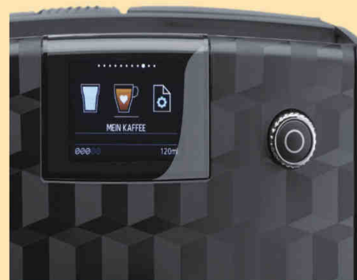
TFT colour display Graphics in colour and clear information in text form guarantee a flawless operation with two rotaires