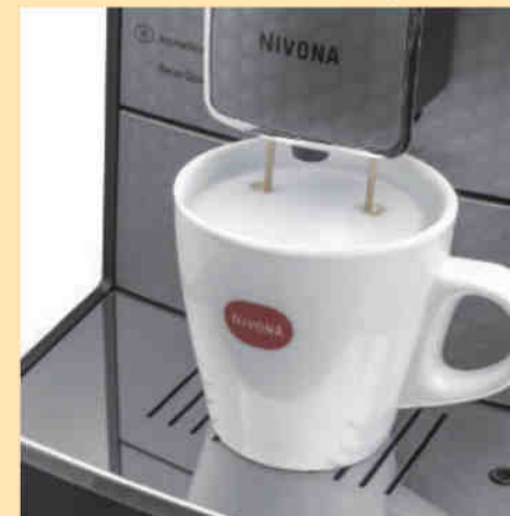
One Touch Spumatore For cappuccino at the push of a button

Aroma Balance System Vary the taste with three aroma profiles, even with only one variety of bean