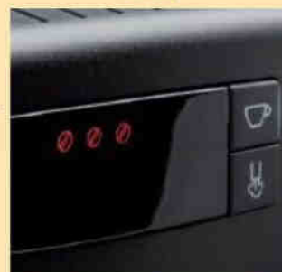
Digital symbol dialogue display Uncomplicated and clearly arranged