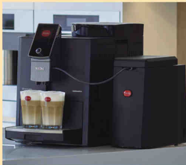
True OneTouch Spumatore Duo for two cappuccinos at the same time, at the push of a button via Touch Display